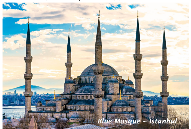
Blue Mosque ~ Istanbul