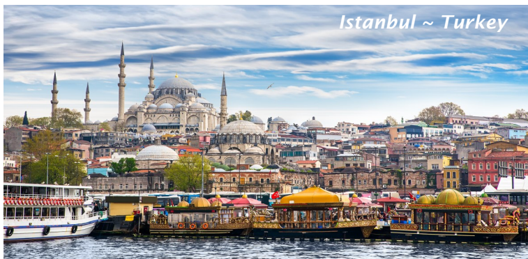
Istanbul ~ Turkey

This morning, visit the ruins of Hierapolis and the natural pools. Next, drive through the meandering Valley to Ephesus, one of the Seven Wonders of the Ancient World and the First Church of Revelation. Ephesus was the capital of Roman Asia Minor and Paul preached and taught here for over two years. View the magnificent harbor and the great amphitheatre, which seated nearly 25,000 people. See the Marble Street, the Library of Celsius, a gym-