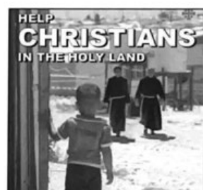
Holy Land Collection

Please bring the Combined Collection for World Charities envelope with you to Mass on the weekend of June 14 th & 15 th , 2025 or mail it directly to your parish.