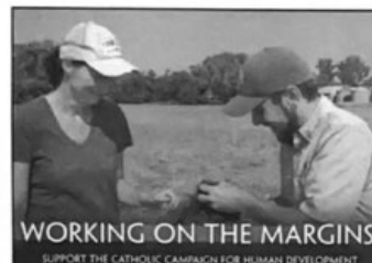
Working on the Margins Campaign for Human Development