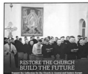
RESTORE THE CHURCH BUILD THE FUTURE Support the Collection for the Church in Central and Eastern Europe Catholic Church in Central and Eastern Europe