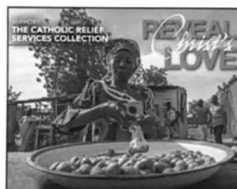
THE CATHOLIC RELIEF SERVICES COLLECTION Catholic Relief Services Collection