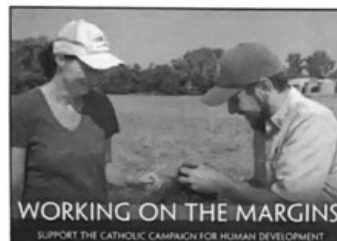
WORKING ON THE MARGINS SUPPORT THE CATHOLIC CAMPAIGN FOR HUMAN DEVELOPMENT Campaign for Human Development

Commitment Weekend June 14 th & 15 th , 2025