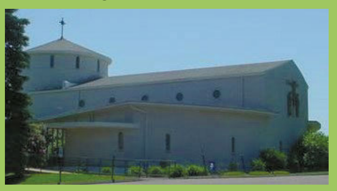
TWELFTH SUNDAY IN ORDINARY TIME JUNE 23, 2024