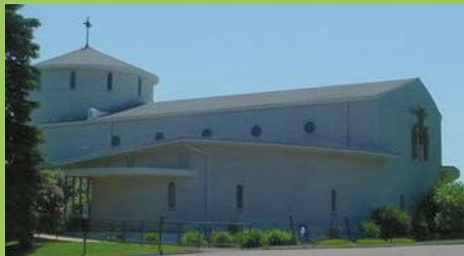
THIRTIETH SUNDAY IN ORDINARY TIME OCTOBER 29, 2023

32 Hebron Road Bolton, Ct 06043 Rectory Phone 860-643-9553 Parish Office 860-643-4466 Parish Center 860-643-8374 Prayer Line 860-643-2837