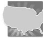
National Combined Collection