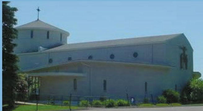
THE TRANSFIGURATION OF THE LORD AUGUST 6, 2023

32 Hebron Road Bolton, Ct 06043 Rectory Phone 860-643-9553 Parish Office 860-643-4466 Parish Center 860-643-8374 Prayer Line 860-643-2837