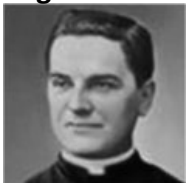
Blessed Michael McGivney Connecticut Parish Priest Founder of the Knights of Columbus