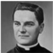
Blessed Michael McGivney Connecticut Parish Priest Founder of the Knights of Columbus

5:00 P.M. Mass offered for All Souls in Purgatory