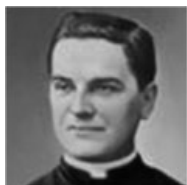
Blessed Michael McGivney Connecticut Parish Priest Founder of the Knights of Columbus