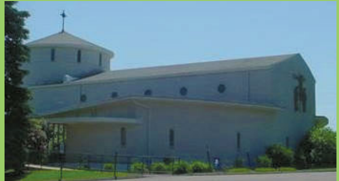
FOURTEENTH SUNDAY IN ORDINARY TIME JULY 3, 2022

32 Hebron Road Bolton, Ct 06043 Rectory Phone 860-643-9553 Parish Office 860-643-4466 Parish Center 860-643-8374 Prayer Line 860-649-5449