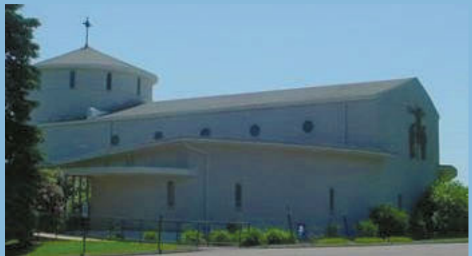
SECOND SUNDAY OF EASTER — DIVINE MERCY SUNDAY APRIL 24, 2022

While the first witnesses to the resurrection have faded into history, there are many others who have come after them. They continue to inspire by walking the talk of faith. They are the martyrs who offer their lives for the Gospel, the simple holy people in our communities who cling so steadfastly to their faith, those who have touched despair and found new hope and the ones who, even in spite of ridicule, still pursue their hunger and thirst for God. They are our friends, acquaintances, biblical heroes, and saints, and many others who are convinced that they have seen the Lord! The risen Christ may not surprise us with the same kind of visit as he did the first disciples, but God finds other ways. All we have to do is open our eyes, remove whatever is preventing us from seeing and believing and exclaim: "My Lord and my God!"