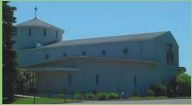
TWENTY-EIGHTH SUNDAY IN ORDINARY TIME OCTOBER 10, 2021

Contemporaries of Jesus would know that a camel could not enter through the portal of a city weighed down with the baggage it was carrying. In order to enter, the baggage must be removed so that the animal could fit through the entry way. The same is true for us. We carry a lot of excessive baggage around with us that keeps us tethered to our past histories, wounds, myopic world views, prejudices, fears, and suspicions. To invest ourselves in the Kingdom of God, do God's work and live out our love relationship with God, we need to shed the extra weight. While it may seem that a lot of that stuff is necessary, it really is not. We are much more than the things that we think define us and more secure than we think. The more there is to hold on to and the more that we carry with us, the harder it will be to leave it all behind. Many choose not to and walk away sad because they are not ready to trust.