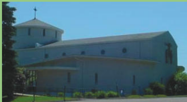
THIRTEENTH SUNDAY IN ORDINARY TIME JUNE 27, 2021

The author of The Cloud of Unknowing prays, "That which I am and the way that I am, with all my gifts of nature and grace, you have given to me, O Lord, and you are all this. I offer it all to you, principally to praise you and to help my fellow Christians and myself." Knowing that God sustains us in being is the key to faith. All that we need to do is to love God as God is and the rest will begin to fall into place. God made us in His image and desires that we have life. God also desires that we be healed of all of our wounds, especially those caused by sin, and know his loving touch. Being weighed down by negativity, imperfections, the cares of the world, and weakness is not something that God desires.