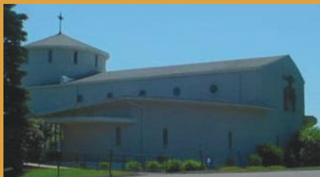
THE HOLY FAMILY OF JESUS, MARY AND JOSEPH DECEMBER 27, 2020

Tragedy and disappointment are inevitable. What sees you through this? There will be challenges, changes, unexpected circumstances, interrupted plans, hurts, and injustices experienced by every human being at some point in their lives. We will be asked to adjust our plans, change course, and even encounter suffering and death. Where do we learn all of the lessons we need to live life well? Some of them we learn along the way but much of what we bring to life, positive and negative, comes from our early beginnings, our families. This is our early world and provides the blueprint for how we see the bigger, more inclusive world, which unfolds before us.