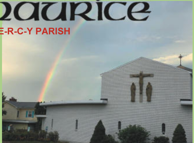
THIRTIETH SUNDAY IN ORDINARY TIME OCTOBER 25, 2020

32 Hebron Road Bolton, Ct 06043 Rectory Phone 860-643-9553 Parish Office 860-643-4466 Parish Center 860-643-8374 Prayer Line 860-649-5449