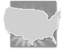
National Combined Collection

Last weekend the National Combined Collection which benefits: The Retirement Fund for Religious, The Annual Appeal for the Holy Father, The Catholic Communications Campaign, and Catholic University of America was taken up in our Parish. To all those who made a gift, thank you for your generous response. If you did not bring your gift envelope to Mass last weekend or if you