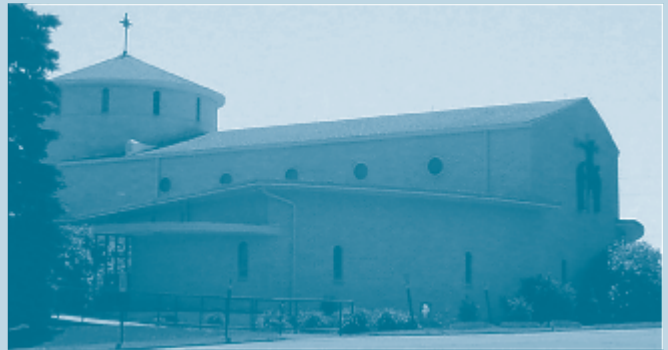
FOURTH SUNDAY OF EASTER MAY 3, 2020

We listened to the wrong voices! In the midst of everything competing for our attention, the voice of the One who could truly call us home got muffled. We didn't hear it. As our inner dialogues continue to play out, the one voice we need to consult — even before our own — is God's. He is the Good Shepherd who can keep us safely where we need to be. As we graze through the stuff of our lives, we must constantly remember to look up, be attentive, and stay focused. Our habits of prayer are the only thing that can properly root us and keep us grounded. Contemplating God's presence and developing an inner awareness of love incarnate, we will then find ourselves praying unceasingly as the days and nights and the ebbs and flows of our lives unfold. Suddenly, the inner conversations we are constantly having are no longer just with ourselves or with voices that can lead us astray but with the Trinity, who desperately wants us to stay home.