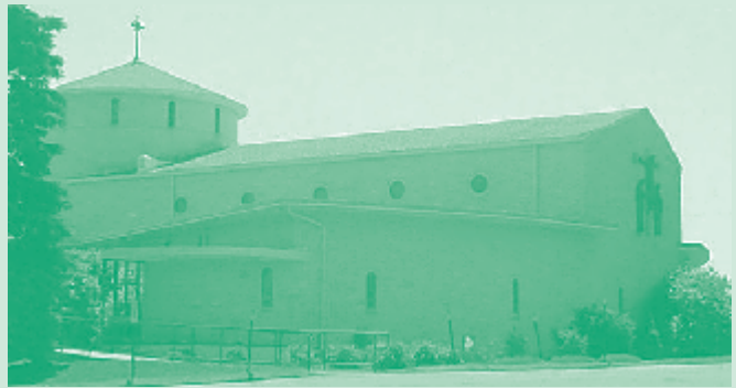
SEVENTH SUNDAY IN ORDINARY TIME FEBRUARY 23, 2020

32 Hebron Road Bolton, Ct 06043 Rectory Phone 860-643-9553 Parish Office 860-643-4466 Parish Center 860-643-8374 Prayer Line 860-649-5449