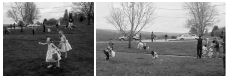
Children enjoyed an Easter Egg Hunt on the church lawn after the 10 a.m. Mass on Easter Sunday.