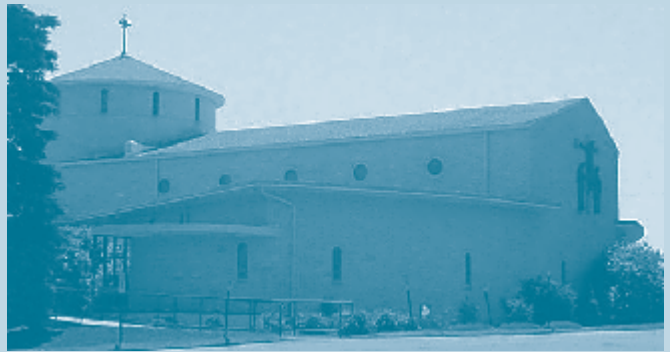
SECOND SUNDAY OF EASTER — SUNDAY OF DIVINE MERCY APRIL 28, 2019

32 Hebron Road Bolton, Ct 06043 Rectory Phone 860-748-4560 Parish Office 860-643-4466 Parish Center 860-643-8374 Prayer Line 860-649-5449 or 860-643-2837