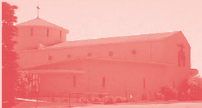
PALM SUNDAY OF THE PASSION OF THE LORD APRIL 14, 2019

Prayer Line 860-649-5449 or 860-643-2837