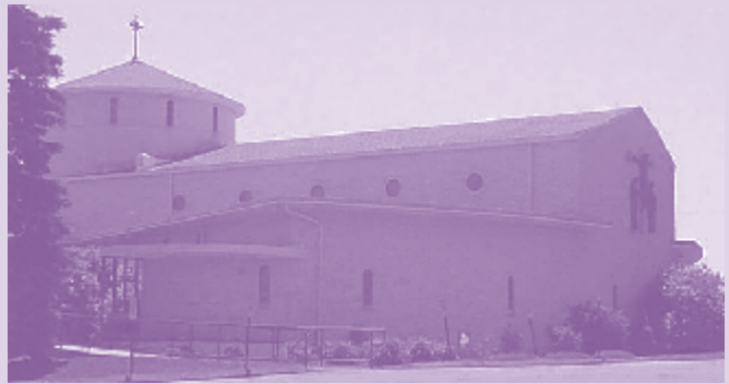
FIFTH SUNDAY OF LENT APRIL 7, 2019

32 Hebron Road Bolton, Ct 06043 Rectory Phone 860-748-4560 Parish Office 860-643-4466 Parish Center 860-643-8374 Prayer Line 860-649-5449 or 860-643-2837