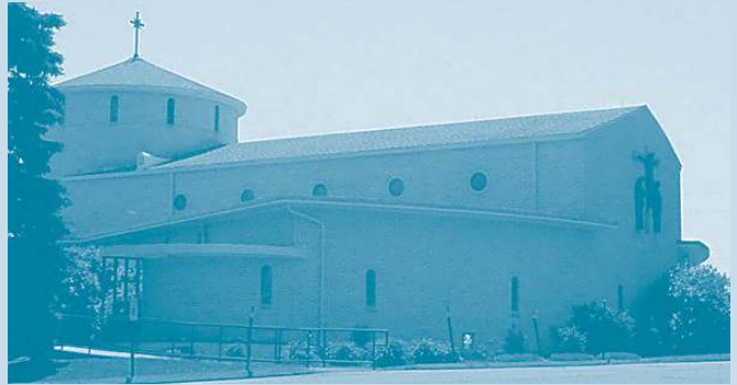
OUR LORD JESUS CHRIST, KING OF THE UNIVERSE NOVEMBER 25, 2018

32 Hebron Road Bolton, Ct 06043 Rectory Phone 860-748-4560 Parish Office 860-643-4466 Parish Center 860-643-8374 Prayer Line 860-649-5449 or 860-643-2837