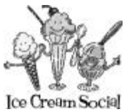
Ice Cream Social

5:00 P.M. Mass Intention is for All Parishioners of St. Maurice Church