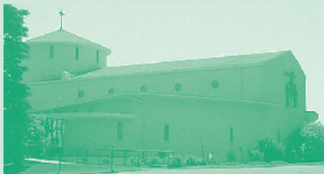
TWENTIETH SUNDAY IN ORDINARY TIME — AUGUST 19, 2018

Prayer Line 860-649-5449 or 860-643-2837