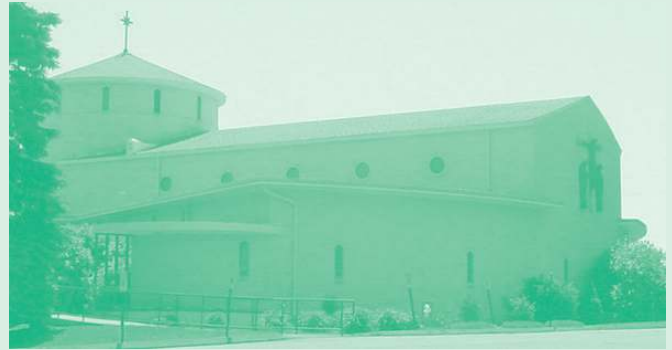
TWENTY-SIXTH SUNDAY IN ORDINARY TIME — OCTOBER 1, 2017

32 Hebron Road Bolton, Ct 06043 Rectory Phone 860-748-4560 Parish Office 860-643-4466 Parish Center 860-643-8374 Prayer Line 860-649-5449 or 860-643-2837