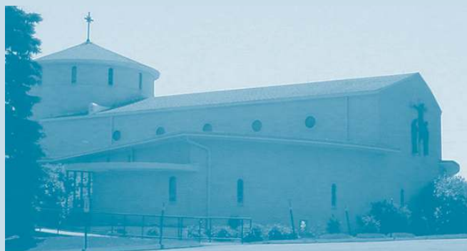
THE TRANSFIGURATION OF THE LORD — AUGUST 6, 2017

Rectory Phone 860-748-4560 Parish Office 860-643-4466 Parish Center 860-643-8374 Prayer Line 860-649-5449 or 860-643-2837