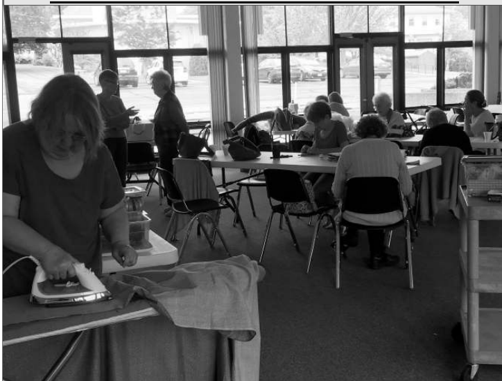
Wednesday Fair Group hard at work!