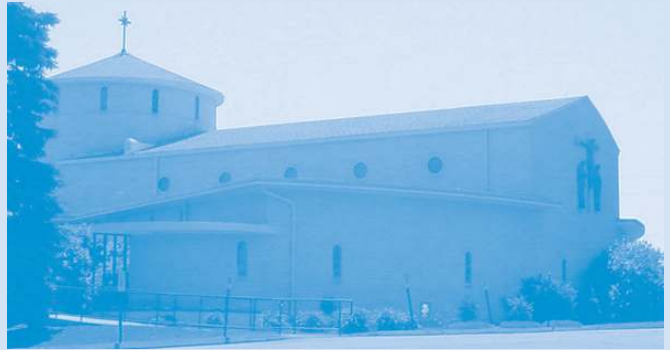
THE MOST HOLY TRINITY — JUNE 11, 2017

32 Hebron Road Bolton, Ct 06043 Rectory Phone 860-748-4560 Parish Office 860-643-4466 Parish Center 860-643-8374 Prayer Line 860-649-5449 or 860-643-2837