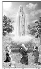
Our Lady of the Rosary of Fatima