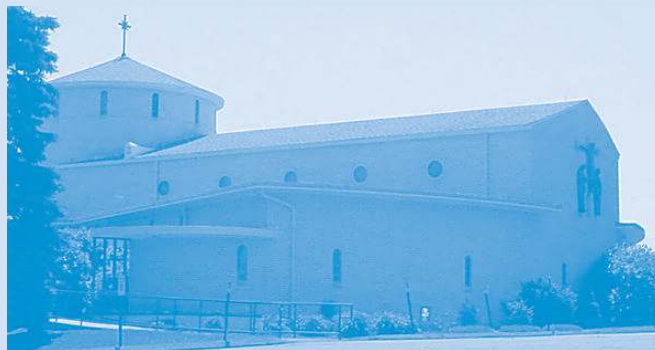
THE EPIPHANY OF THE LORD — JANUARY 8, 2017

Rectory Phone 860-643-4466 Parish Center 860-643-8374 Prayer Line 860-649-5449 or 860-643-2837