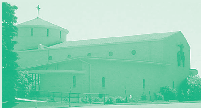
THIRTIETH SUNDAY IN ORDINARY TIME — OCTOBER 23, 2016

Rectory Phone 860-643-4466 Parish Center 860-643-8374 Prayer Line 860-649-5449 or 860-643-2837