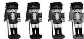
CHRISTMAS FAIR WORKSHOP