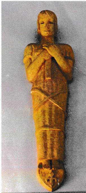
St. Joan of Arc May 30