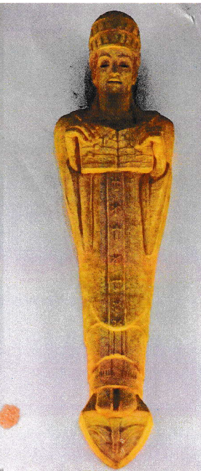
St. Gregory the Great September 3