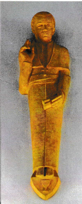
St. Pius X August 21