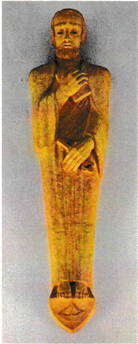
St. Peter June 29