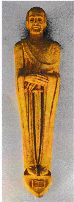
St. Paul June 29